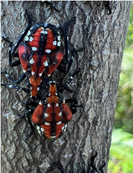
4th instar nymphs

will be bright red with black and white patterning. When they reach this stage, nymphs are easily confused for a number of insect look-a-likes, such as milkweed bugs or lady beetles. It should also be noted that nymphs have a protrusion from their head that make them easy to confuse for insects such as weevils, but this protrusion is lost once they become adults. Spotted lanternfly nymphs are very mobile and will move between host plants, typically feeding from twigs and smaller branches. They will continue to feed until they molt into their adult form in July or August.