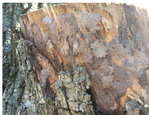
Egg masses laid on tree

Spotted lanternflies lay eggs in masses of between 30 to 60 eggs, typically arranged in neat rows. The eggs are covered in a protective substance that closely resembles mud, making detection of egg masses challenging. Initially, this substance will appear whitish, eventually turning pink and dark tan as it dries. It is not unusual to find egg masses that are only partially covered, or even masses that completely lack any protection. Spotted lanternflies often lay eggs on or near their preferred host plants, but they will utilize a variety of substrates. These surfaces include tree bark, rocks, the siding of a house, or the outside of a train car, to name a few. Adults will begin to lay eggs starting in September until the first freezing temperatures. Egg masses will persist through Indiana's winter season, eventually hatching in the spring.