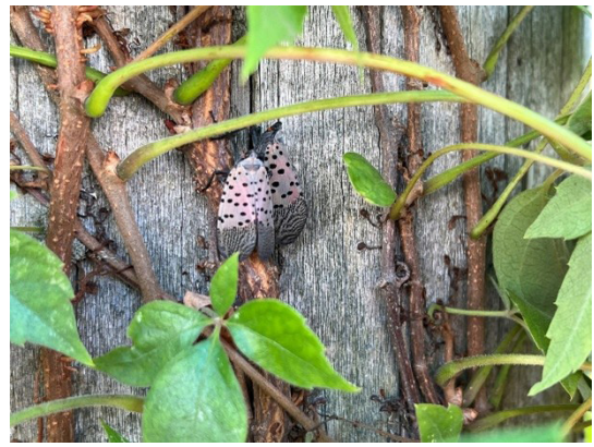
Spotted lanternfly adults on Virginia creeper

Adults are poor fliers and will travel to different hosts and egg-laying substrates through a combination of flight, walking, and hopping. They often gather in large numbers and initially start to feed on preferred host plants. As host-plants become overwhelmed, they will move to other hosts such as black walnut and maple. Females will lay one or two egg masses during their lifetimes. Spotted lanternflies have only one generation per year, with adults dying with the first freeze. In Indiana, active adults have been seen as late as November.