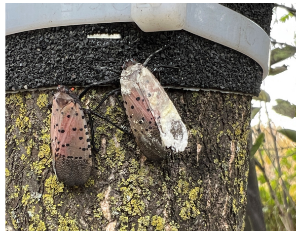
Potential fungal infection on adult spotted lanternfly

There are few options when it comes to a biocontrol plan to manage spotted lanternfly. Natural enemies will prey on the insects, but not to any degree that offers effective population reduction. Two native entomopathogenic fungi, Baktoa major