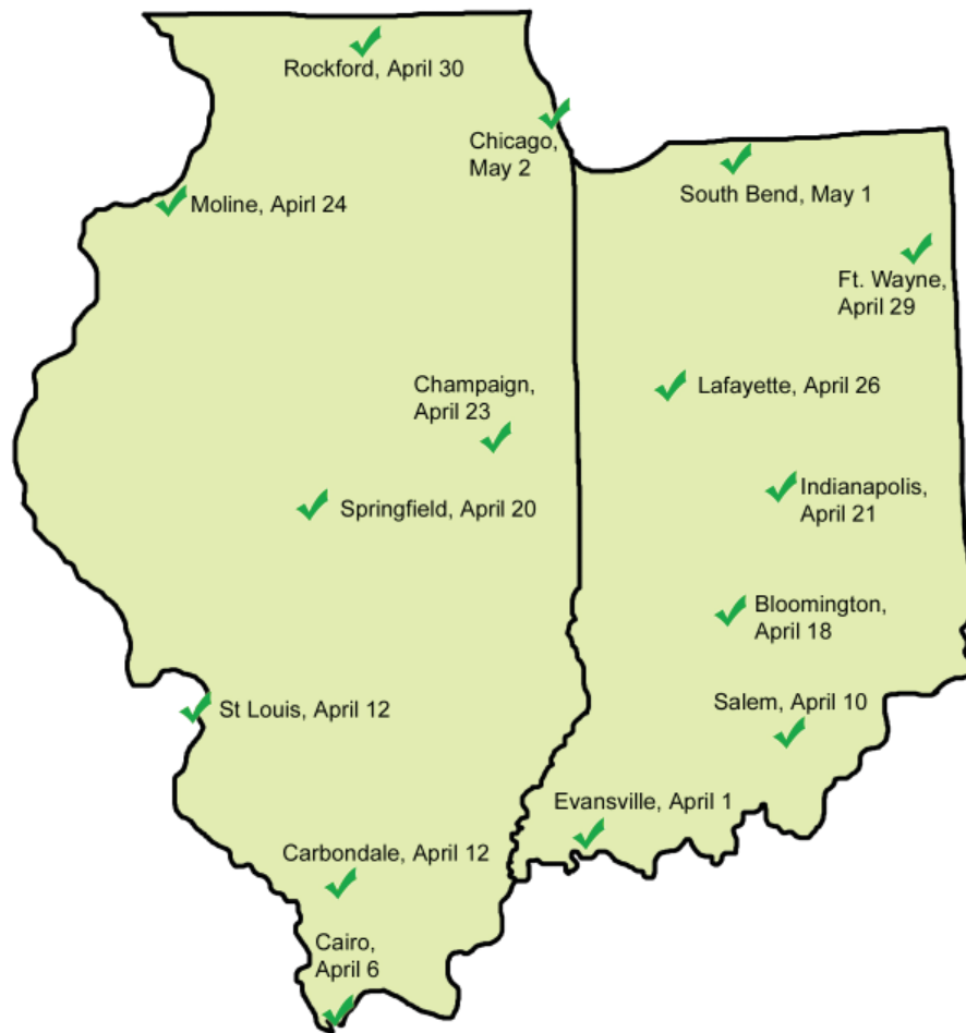
Figure 3. Predicted crabgrass germination date in Illinois and Indiana based on normal weather data. Remember that preemergence herbicides must be applied at least two weeks prior to these dates to control crabgrass