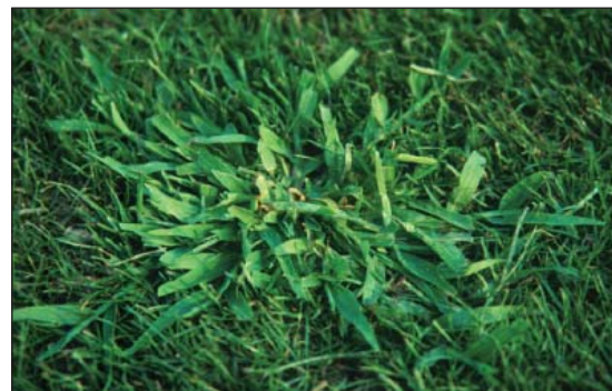
Figure 1. Mature crabgrass plant (Zac Reicher).

Irrigate deeply and infrequently. Daily, light irrigations promote shallow rooting, non-drought hardy turf, and encourage crabgrass. Water to wet the soil to the depth of rooting, and then do not water again until you see the first sign of drought stress (When drought stressed, turf will become bluish gray and footprints will remain in the turf after it is walked on).